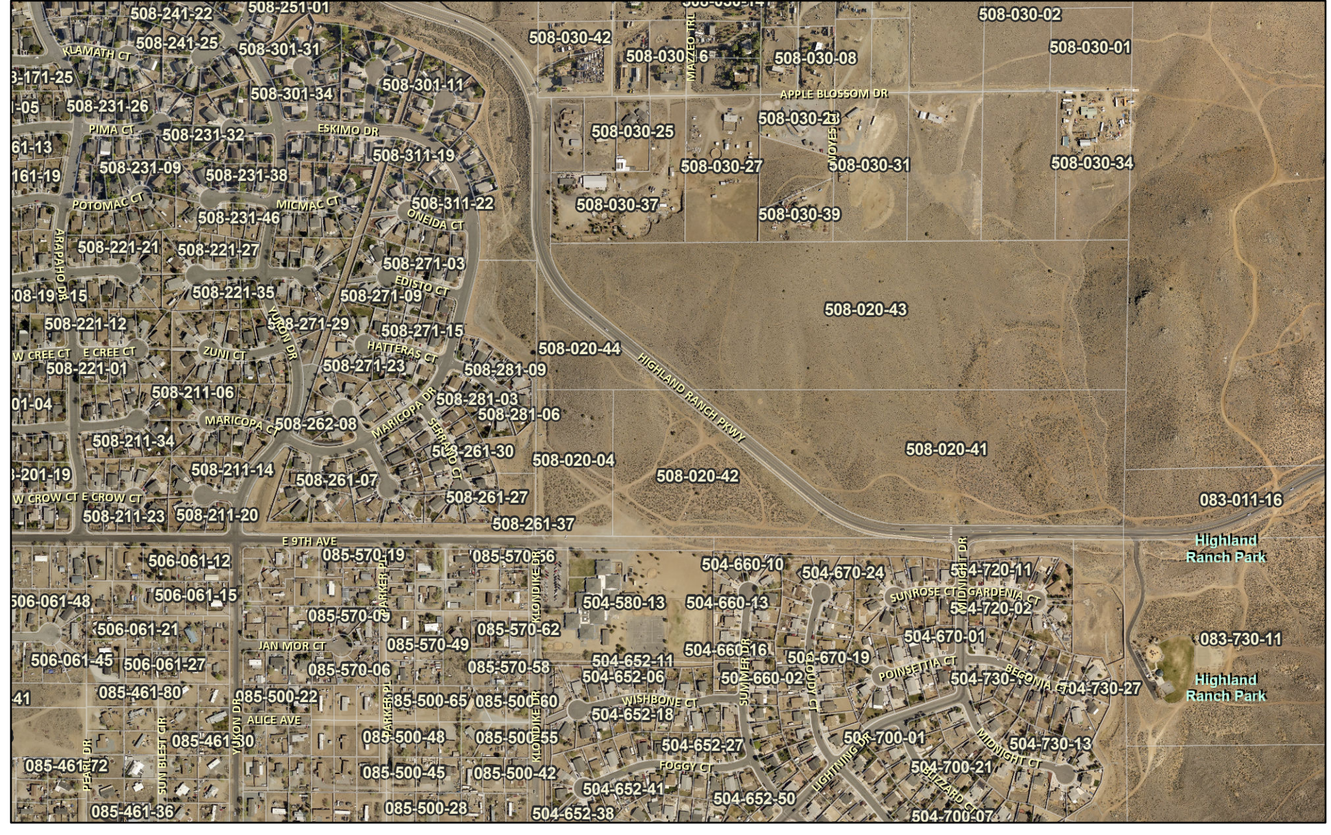
April 8, 2024